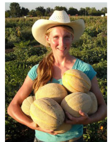
"EYES UP HERE," she cried as she ran away. Authorities note that she is currently the prime suspect.