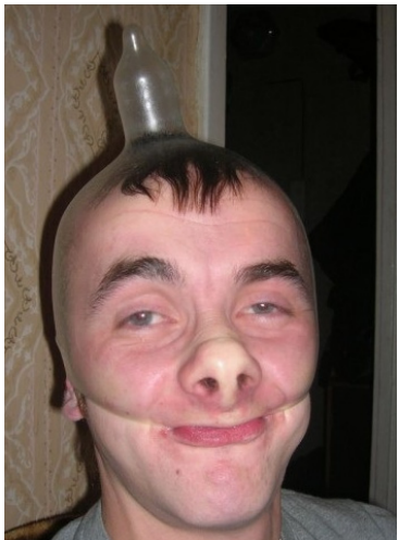
Stupid? Hey! I remember that statement!

The latest epitaph may not be against a minority, but a majority of the American people. And the people being made the butt end of this cruel joke are not