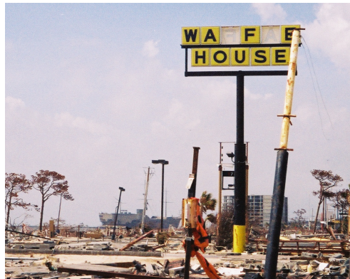
Little Known Fact: Congress is also a waffle house.

"Green means the restaurant is serving a full menu, a signal that damage in an area is limited and the lights are on. Yellow means a limited menu, indicating power from a generator, at best, and low food